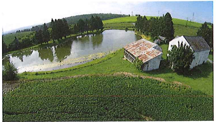
Heintzelman Tract located off of West Beil Avenue .

DCNR also funded improvements at the 90 acre "Ballas Tract" located off of Kromer Road. Trail construction began in 2016 and includes a one mile perimeter trail, fishing pond and overlook area.